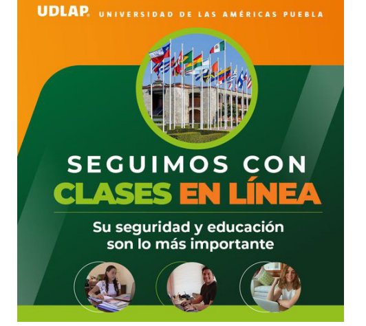
Figure 7. The three posts that annoy me the most from UDLAP.