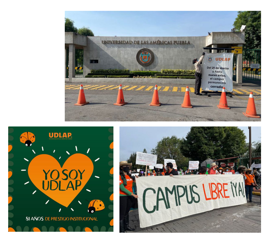
Figure 2. The three most liked posts from UDLAP.

For the highest number of loves (with 2k), UDLAP published the following on May 10, 2021: "After 415 days closed, the time has come to open our doors. Today we welcome our community in this #SafeReturnTo-Campus"; The second note (with 1.3k) was published on July 3, 2021, with the text: "UDLAP means institutional prestige. We are the best private university in Mexico and one of the most important in Latin America, thanks to our accredited academic programs, excellent professors, international experience and successful graduates #YoSoyUDLAP #OrgulloUDLAP", where the sense of belonging is emphasized, and thirdly place (with 1.2k) is the same publication that has the third place with the most likes. All three are focused on love and actions for the university.