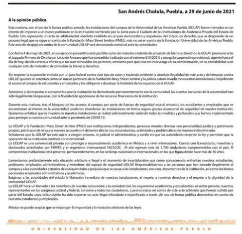
Figure 8. Publication with the highest number of favorable comments.

Some of the comments favorable or in support of the publication are the following: