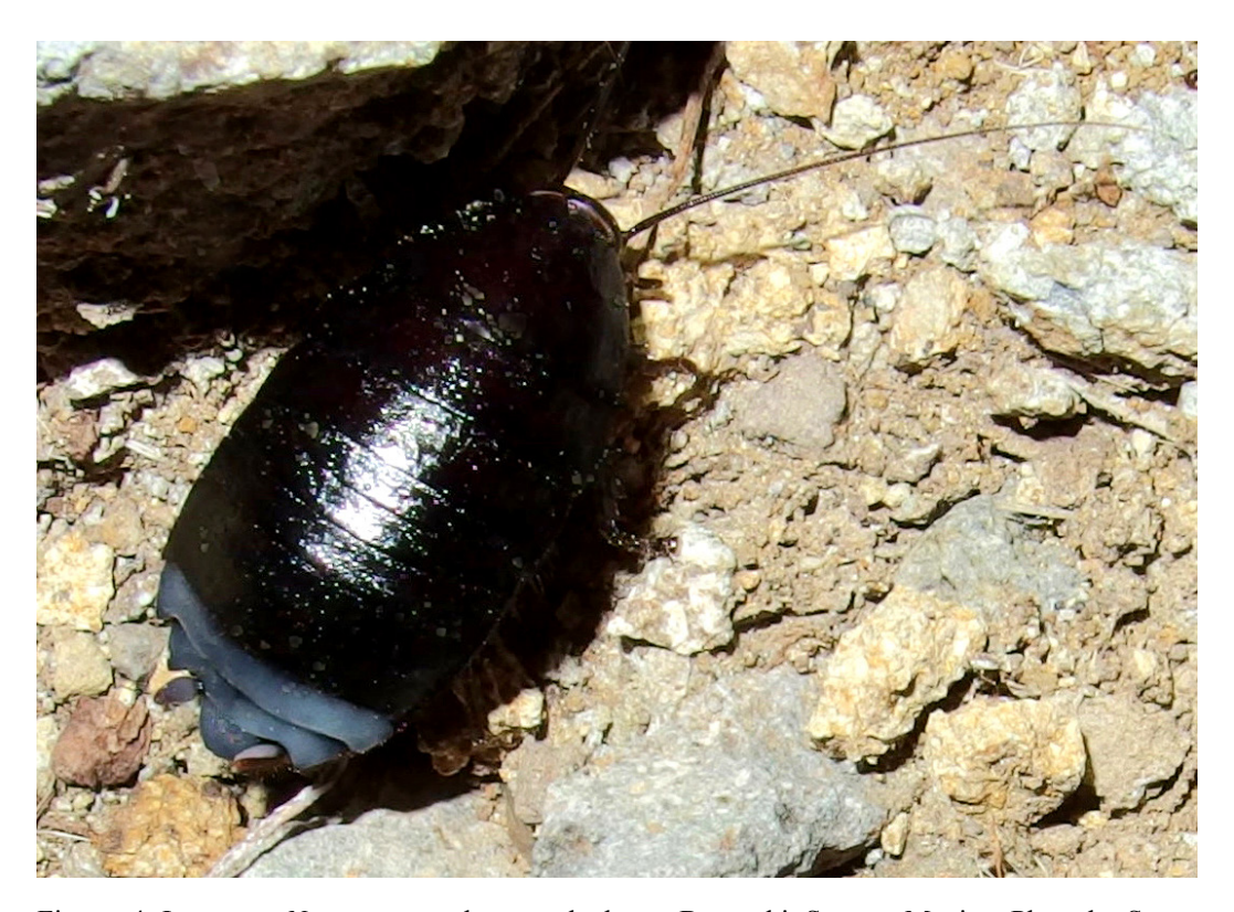
Figure. 4: Immature N. tetrasticta photographed near Bacoachi, Sonora, Mexico.