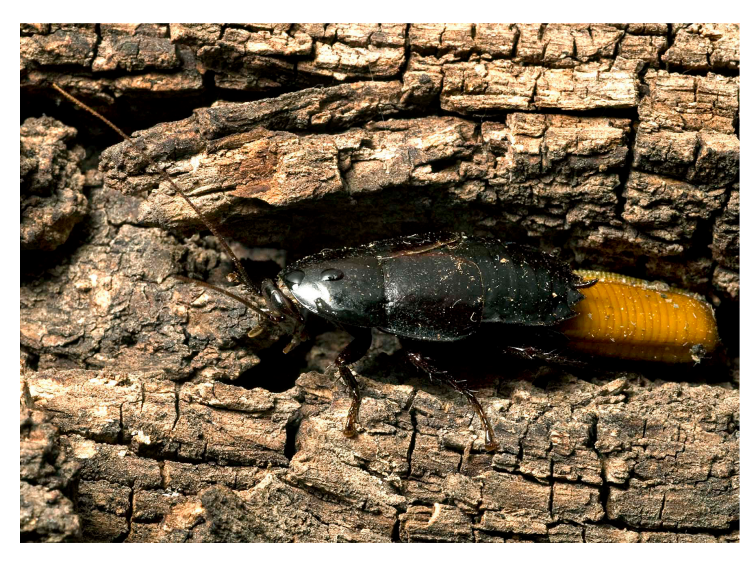
Figure 2: Adult female N. tetrasticta with ootheca photographed at Rancho los Alisos, Sonora, Mexico.