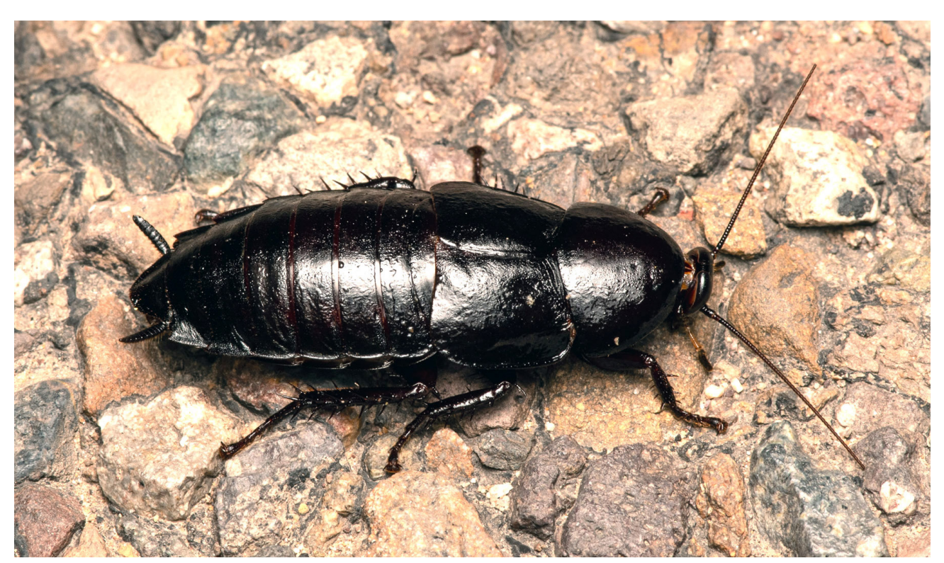
Figure 3: Adult female N. tetrasticta photographed near Bacanora, Sonora, Mexico.