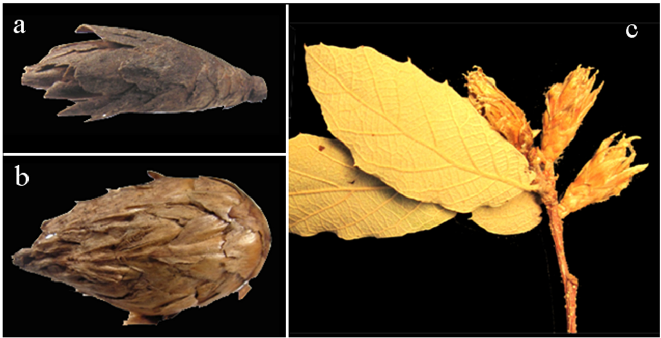
Fig. 3. Galls of Erythres : (a) E. hastata from the Kinsey collection (AMNH, NYC), (b) E. jaculi from the Kinsey collection, and (c) galls of E. hastata collected from Zacatecas.